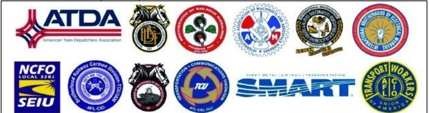
Above: The logos of all 12 of the United Rail Unions. The Coordinated Bargaining Coalition are: the American Train Dispatchers Association (ATDA); the Brotherhood of Locomotive Engineers and Trainmen (BLET) / Teamsters Rail Conference (TRC); the Brotherhood of Railroad Signalmen (BRS); the International Association of Machinists (IAM); the International Brotherhood of Boilermakers (IBB); the International Brotherhood of Electrical Workers (IBEW); the National Conference of Firemen & Oilers (NCFO)/Service Employees International Union (SEIU); the Brotherhood Railway Carmen Division (BRC)/ Transportation Communications Union (TCU); the TCU/IAM; the Transportation Division of the International Association of Sheet Metal, Air, Rail, and Transportation Workers (SMART-TD) and the Transport Workers Union of America (TWU). The Brotherhood of Maintenance of Way Employees Division (BMWED)/TRC and SMART Mechanical Unions are also bargaining as a coalition. Collectively, these Unions represent approximately 140,000 railroad workers covered by the various organizations' national agreements, and comprise 100% of the workforce who will be impacted by this round of negotiations.

All 12 rail unions are now negotiating as one unified entity in this current round of national bargaining. Supporters of RWU have waited for a long time for such a step in the right direction.