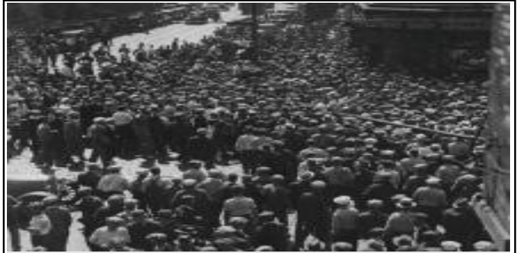
25,000 strikers and supporters packed the warehouse district in Minneapolis, in this mobilization of strength and power during the 1934 Teamster strike. In addition to the political necessity of responding to the Great Depression’s hardships, FDR’s New Deal laws were concessions to put out the fire on labor’s growing militancy.

Ronald Reagan’s myths about “welfare queens driving Cadillacs” resonated with many Americans, including some union mem-